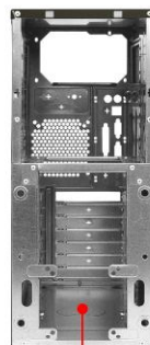
Front Fan: 80x80 mm x 1 or 90x90 mm x 1 (Optional)