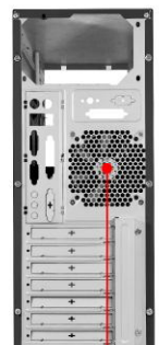
Rear Fan: 80x80 mm x 1 or 90x90 mm x 1 (Optional)